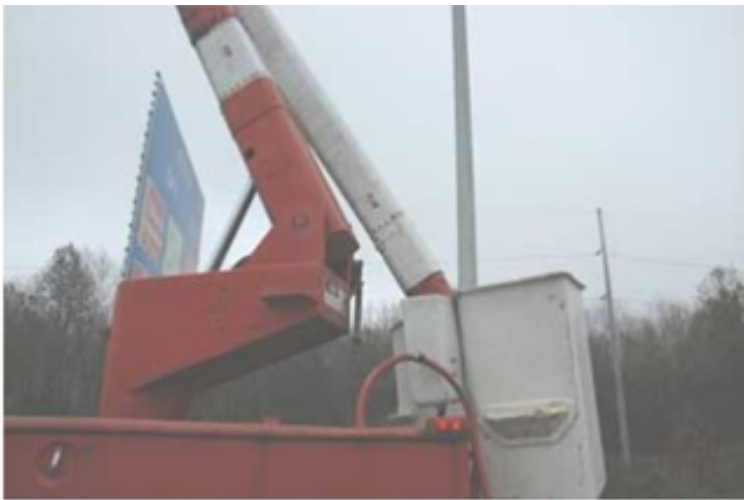
Photo 1: Aerial lift boom after incident. Note that the lower boom section remains elevated while the bucket-end of upper section is in a lowered position.

A 45-year-old owner of an electrical contracting company died after falling 9 feet to the road when the articulating boom of the aerial lift truck he was working from collapsed (photo 1).