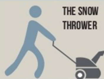
THE SNOW THROWER

The push technique is recommended when snow is deep, wet and heavy. Instead of scooping heavy piles of snow, use your shovel to push snow, clearing enough space for you to use your pathway, sidewalk or driveway.