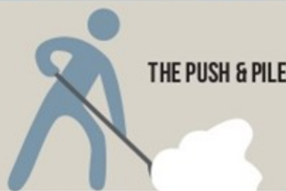
THE PUSH & PILE

Use this technique when the snow is light and fluffy, using the recommended weight and throw restrictions cited.