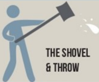
THE SHOVEL & THROW

Use this technique when the snow is light and fluffy, using the recommended weight and throw restrictions cited.